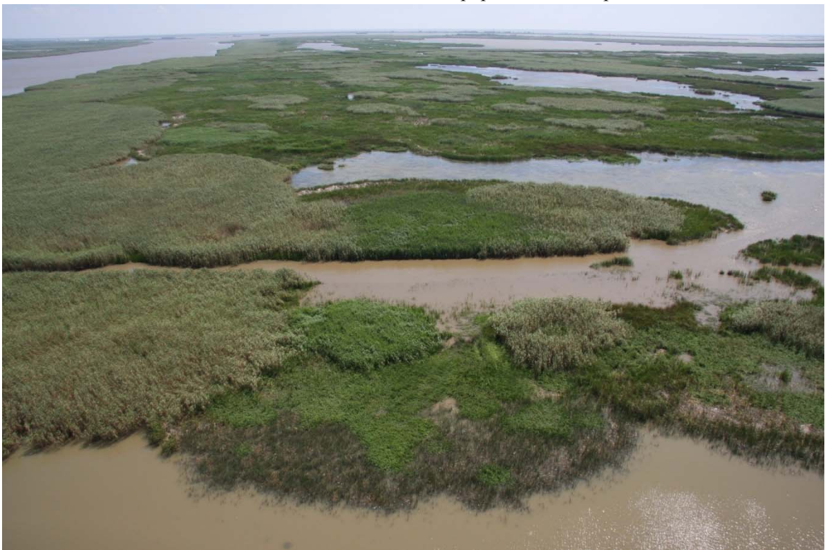
Mississippi River Delta. Patches of different colour are P. australis genotypes of different phylogeographic origin and have different morphology and photosynthetic traits